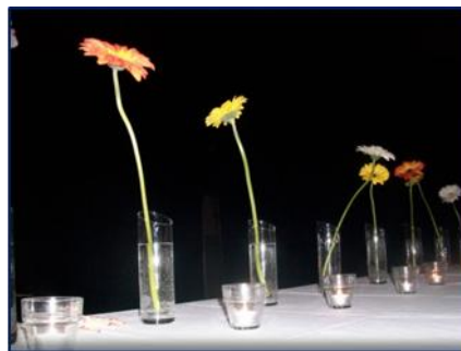
April 2010 Celebration of Donors, Human Anatomy Program